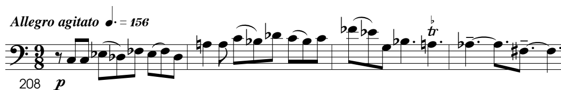
Figure 5.7. Op. 47, sixth variation, fugue subject in second cello

In order to play the rhythm of the fourth measure accurately, it is necessary to subdivide the beats into duple eighths rather than the triplets inherent in the time signature. The player may note a tendency to maintain the regular subdivision, and to play these two notes in a 5:4 ratio. While such an approximation will not be problematic,